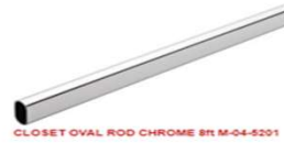
CLOSET OVAL ROD CHROME 8 1/4" M-04-5201