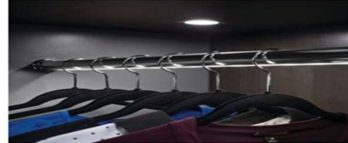
CLOSET LED LIGHTING

Support@PerfectFitCanada.com OR 1866 227 2006